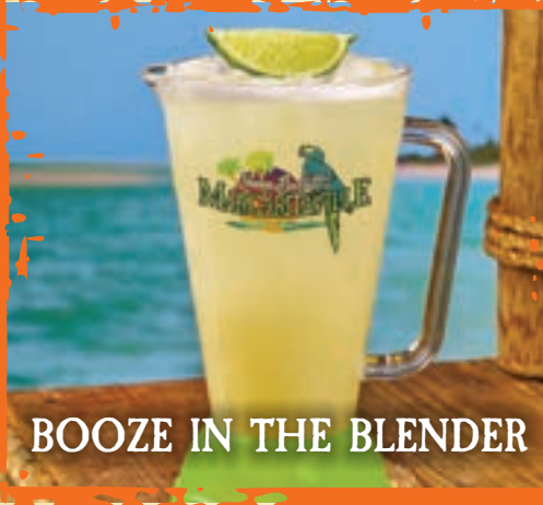
BOOZE IN THE BLENDER

Margaritaville Silver Tequila, Blue Curaçao, and our house margarita blend. Served on the rocks (280 calories) $10.75